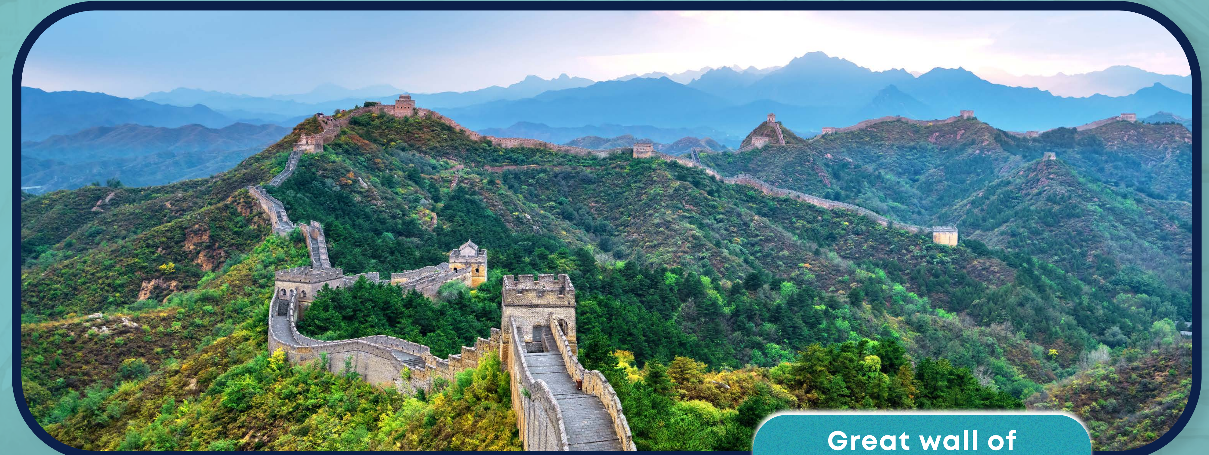
Great wall of China