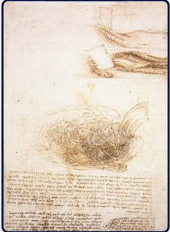
Studies of Water (1508-1509)