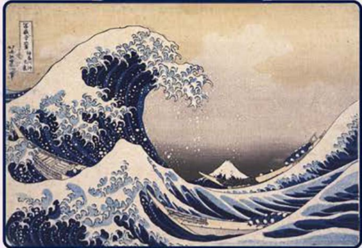
The Great Wave (1829-1833)