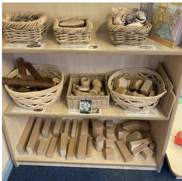
Block and small world area

Whilst the Nursery building is separate from the rest of the school, we have some shared time with the Reception classes and have an important role in many events involving the whole school.