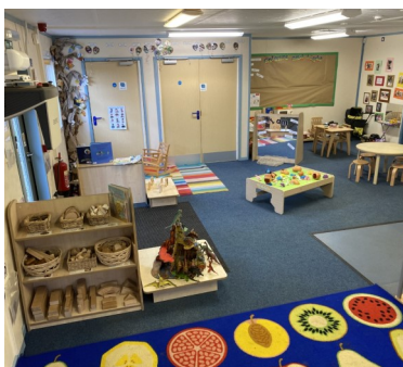
Nursery Provision Indoors