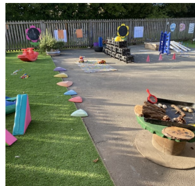
Nursery Provision Outdoors